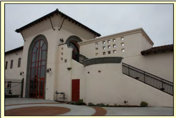
Santa Maria Police Department