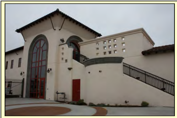
Santa Maria Police Department